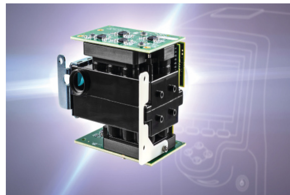
Optoelectronic module for a Molecular Diagnostics POCT device